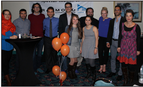
Left: Graduate students gather for a group photo.