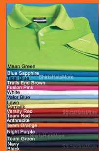
Shirt color options

BCN Merchandise Nike Golf Dry Fit Shirts.....$55 Hard Hat .....$45 Coffee Mugs..... $10 Portfolios..... $30